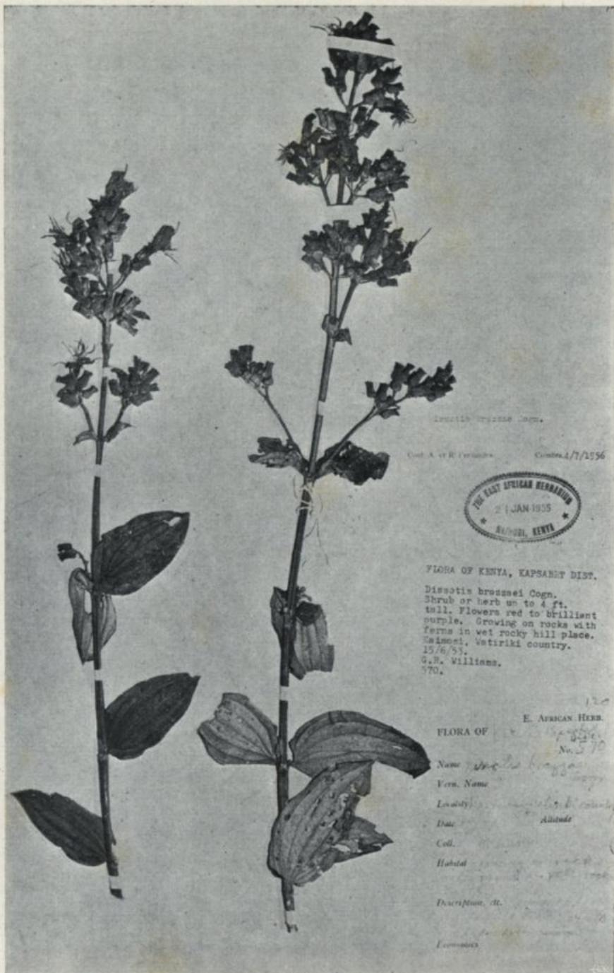
Dissotis Brazzae Cogn.